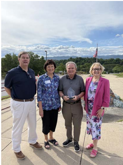
the club's Rotary Readers program at Mountain View Elementary School in Johnson City.